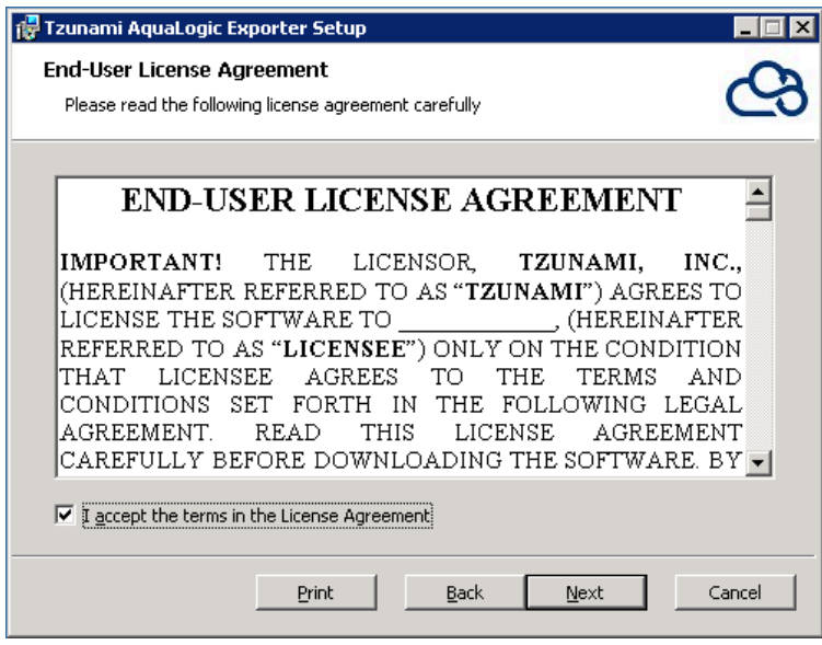
Figure 1-3: End-User License Agreement Window

2. In the End-User Licensing Agreement panel, click "I accept the terms in the License Agreement" and click Next to continue installation.