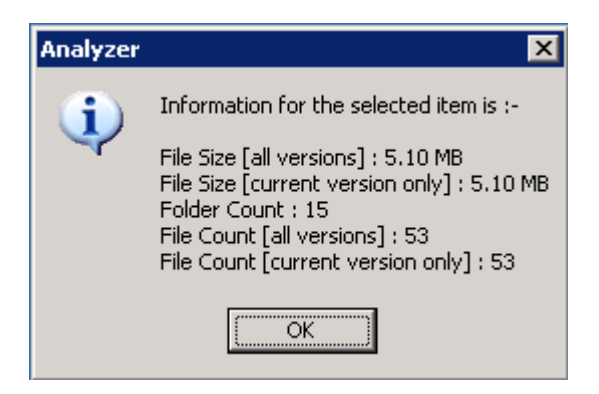
Figure 2-8 Analyzer Information