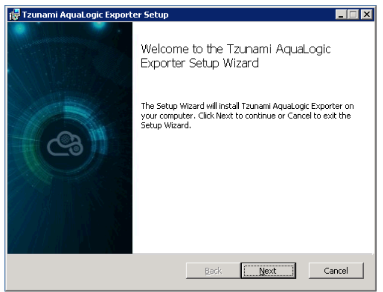
Figure 1-2: Welcome Window

1. Unzip the zip file, and run TzunamiAquaLogicExporter.msi. The Tzunami AquaLogic Exporter Setup Wizard (Welcome window) will launch. To advance through the install wizard, click Next on the bottom of the window.