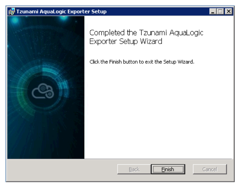
Figure 1-6: Installation Complete Window

5. In the Completed Tzunami AquaLogic Exporter Setup Wizard, to exit the wizard, click Close .